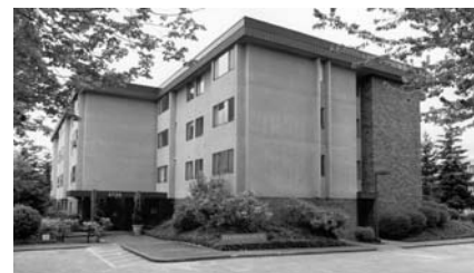
Ellsworth House 50 Units of Senior Housing on Mercer Island

Today, thanks to continued community support and investment, St. Andrew's Housing Group is an affordable housing industry leader, managing assets worth more than $20 million, and providing 208 units of affordable housing on King County's Eastside that serve more than 546 individuals and families each year . We provide affordable housing in Mercer Island, Issaquah, Factoria, Redmond, Bellevue, and Kirkland. Currently SAHG is in the process of acquiring 60 units of existing housing and building 50 units of new housing that will give enough capacity to nearly double our resident population.