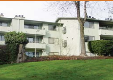
June, 2007 - Secured 100% of capital funding for 280 Clark's rehab and new construction which will start in Fall, 2007.