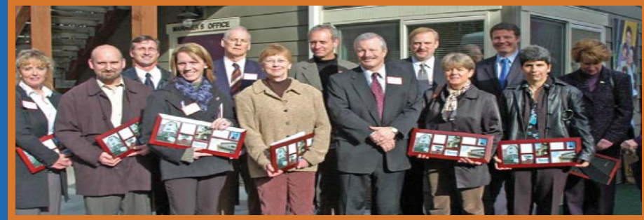
February 8, 2007 - Rose Crest at Talus celebrates its official grand opening with its' project team, financial partners, advisors, staff and community supporters.

Currently SAHG manages 318 affordable units that in 2006 served more than 660 individuals, which included 230 children, 92 seniors and 132 persons with special needs. SAHG provides affordable housing in the following Eastside communities: Bellevue, Factoria, Issaquah, Kirkland, Mercer Island and Redmond. SAHG serves the poor, including those transitioning directly from homelessness, as well as the working poor. Currently, 38% of SAHG's residents are children, 46% are female-headed households and 10% of the households were formerly homeless.