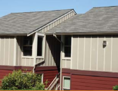
July, 2006 - Renovation started on Mine Hill in Issaquah, a 28-unit Section-8 property in Issaquah.