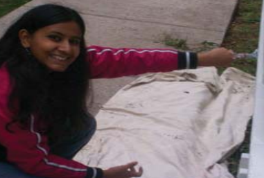
September 21, 2006 - Microsoft employees participated in United Way's "Day of Caring" at Highland Gardens in Issaquah.