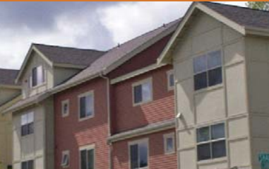
November 1, 2006 - Rose Crest at Talus opens two of five of its buildings, welcoming new residents just in time for the holidays.