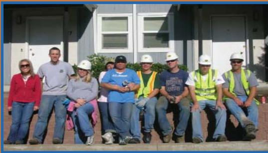
September 15th, 2007 - a group of volunteers from PCL Construction built a new retaining wall at Chalet Apartments in Bellevue during United Way's Day of Caring.

By providing affordable rental housing, SAHG removes one of the foundational obstacles contributing to individual and family poverty—the burden of high housing costs. Because of SAHG's