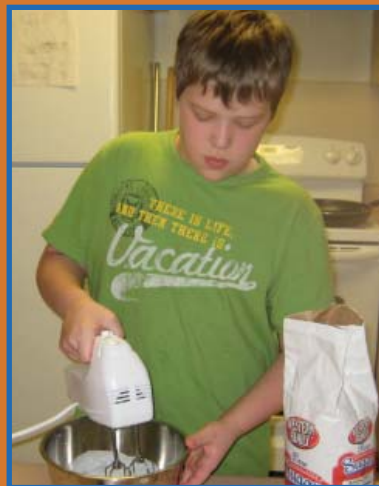
A young resident of Highland Gardens learns some basic cooking skills thanks to SAHG's new residents services program.

Currently, SAHG manages 318 affordable units that in 2007 served more than 800 individuals, which included children, seniors and people with special needs. SAHG provides housing in the following Eastside communities: Bellevue, Factoria, Issaquah, Kirkland, Mercer Island and Redmond. SAHG serves the poor, including those transitioning directly from homelessness, as well as the working poor.