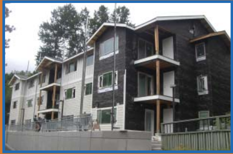
Johnson Hill Apartments in Issaquah is nearing completion. The new construction allows for eight new supported units in partnership with Hopelink.

St. Andrew's Housing Group (SAHG) is dedicated to improving the quality of life for people with limited income on King County's Eastside, empowering these families to succeed by providing housing and access to services while strengthening local communities and encouraging diversity.