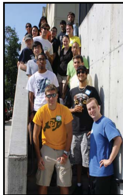
Microsoft interns prepare for a day of fun at Rose Crest.

On July 10th, a group of 15 interns from Microsoft joined St. Andrew's Housing Group for a day of fun and food at Rose Crest, a 50-unit complex in the Talus Development of Issaquah. With excitement and passion, these volunteers led roughly 30 kids at Rose Crest through various activity stations throughout the day. Activities included a silly relay race, decorating canvas lunch bags, building and coloring balsa wood creations and creating pretty pencil pinwheels.