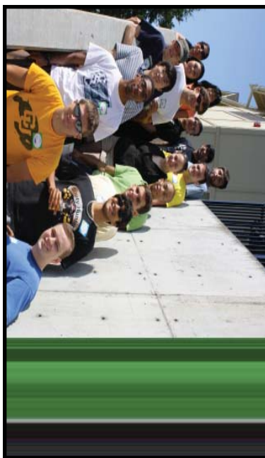
Microsoft interns prepare for a day of fun at Rose Crest.

On July 10th, a group of 15 interns from Microsoft joined St. Andrew's Housing Group for a day of fun and food at Rose Crest, a 50-unit complex in the Talus Development of Issaquah. With excitement and passion, these volunteers led roughly 30 kids at Rose Crest through various activity stations throughout the day. Activities included a silly relay race, decorating canvas lunch bags, building and coloring balsa wood creations and creating pretty pencil pinwheels.